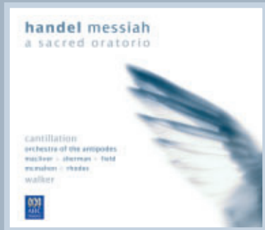
handel messiah (Complete) 2-CD set 472 601-2